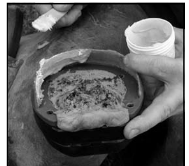
Left: Cutting a depression in the Advance Cushion Support. Right: Applying EquiloX to the felt-covered cuff.