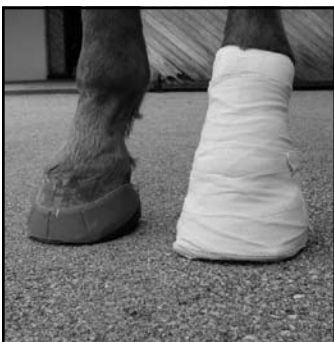
Ultimate Applied with Cotton Bandage